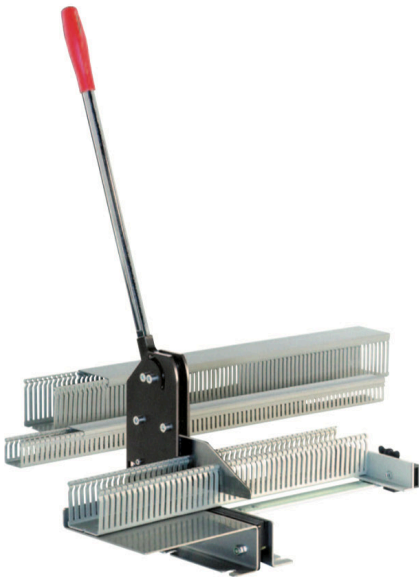
DC 125 cutter for trunking 0518 0960 000 C3/7-01

For a fast cut of our conduit trunking, SES-STERLING offers a selection of special tools .