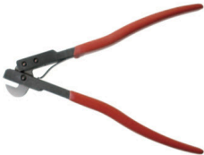
DK-60 nibbling tool 0518 0920 000 D4/6-01