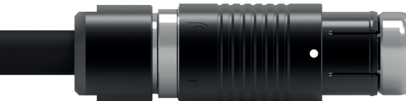
105 (2 to 9 contacts)