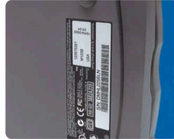
B-8423 material is ideal for numerous applications such as rating plates for electronic equipment.